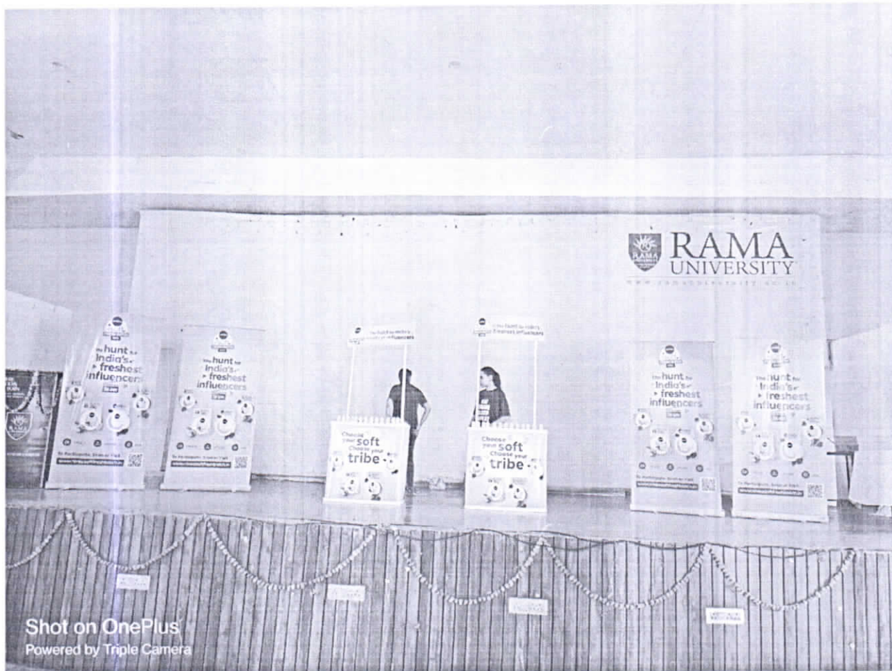
The Nivea Setup